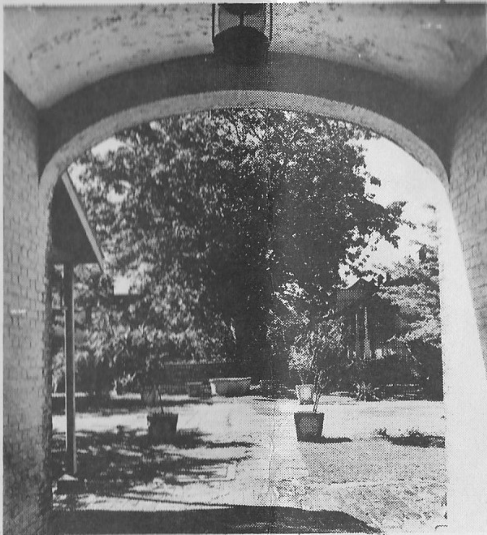
BEFORE RENOVATIONS. VIEW OF THE OLD STAGE AND COURTYARD